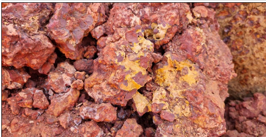
FIG 1: Bauxite ore